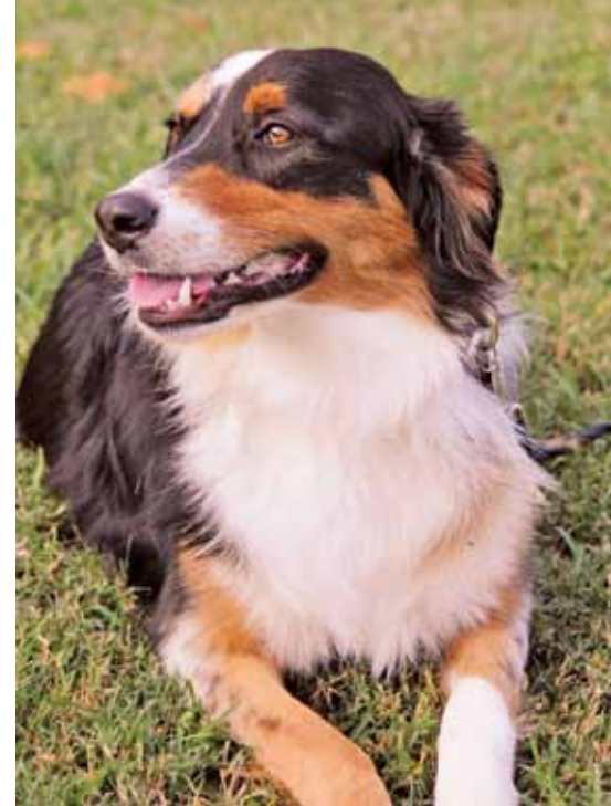
Carter trains dogs at local Sugar Land parks