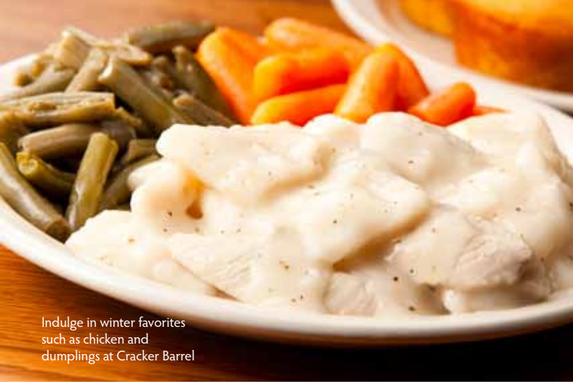
Indulge in winter favorites such as chicken and dumplings at Cracker Barrel