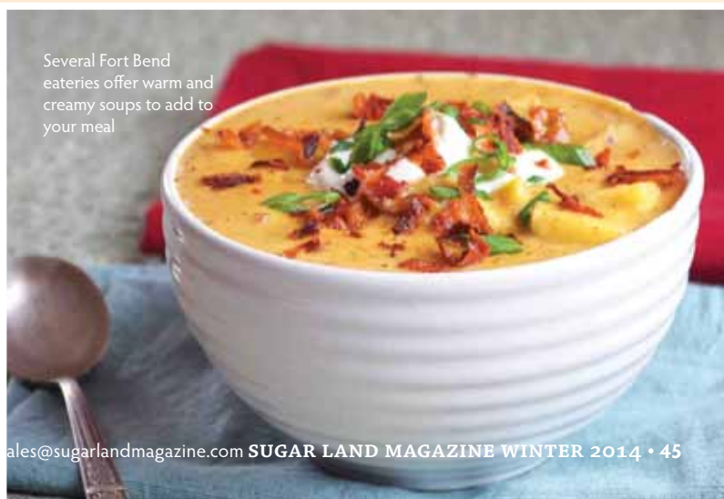
Several Fort Bend eateries offer warm and creamy soups to add to your meal