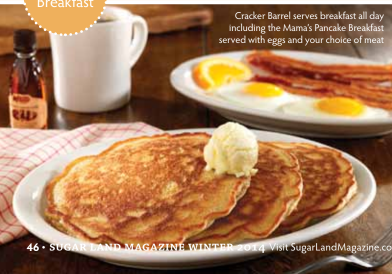
Cracker Barrel serves breakfast all day including the Mama's Pancake Breakfast served with eggs and your choice of meat