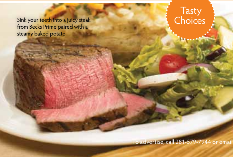
Sink your teeth into a juicy steak from Becks Prime paired with a steamy baked potato

Filled with hot, wholesome vegetables and a creamy sauce and topped with a flaky crust, Cheddar's chicken pot pie is like a slice of home. "It's a classic, just like everybody's mom used to make," says restaurant manager Robert Walker. The chicken pot pie is handmade fresh every morning and comes with a side or a salad that's sure to warm your tummy. "It's a hearty meal," adds Walker.