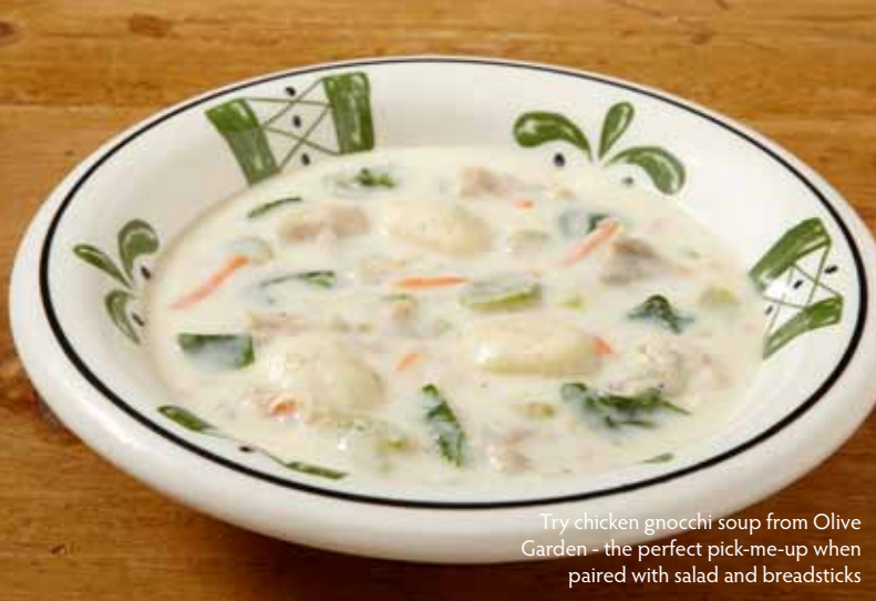
Try chicken gnocchi soup from Olive Garden - the perfect pick-me-up when paired with salad and breadsticks