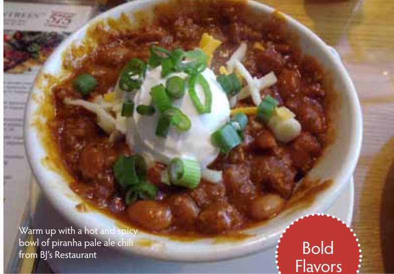
Warm up with a hot and spicy bowl of piranha pale ale chili from BJ's Restaurant