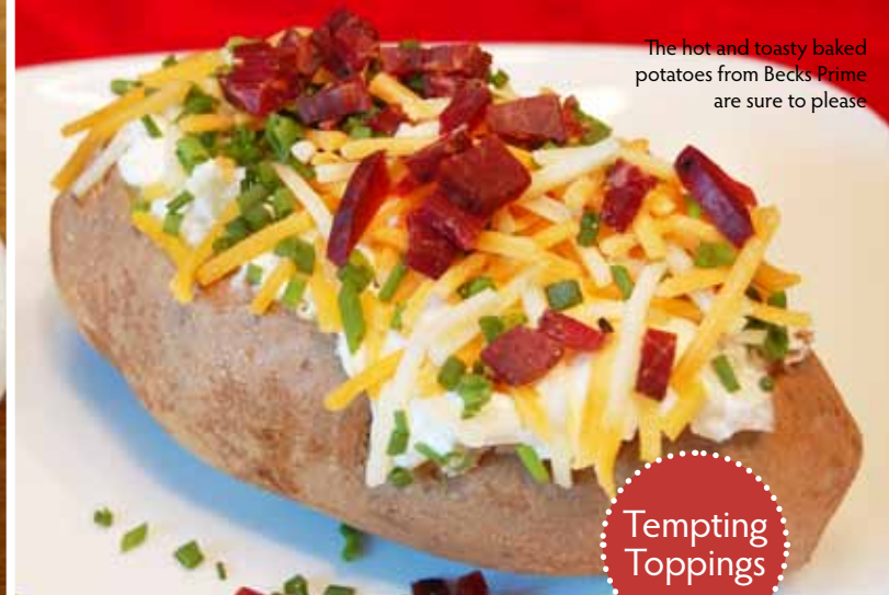
The hot and toasty baked potatoes from Becks Prime are sure to please