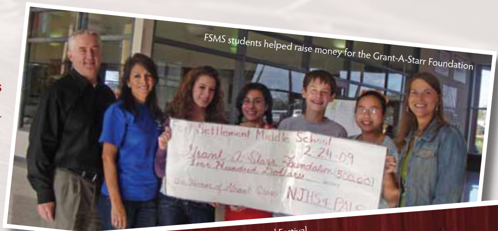
FSMS students helped raise money for the Grant-A-Starr Foundation

We enjoy showcasing outstanding local schools. If you would like your school profiled in Campus Snapshot, tell us! Email editor@sugarlandmagazine.com.