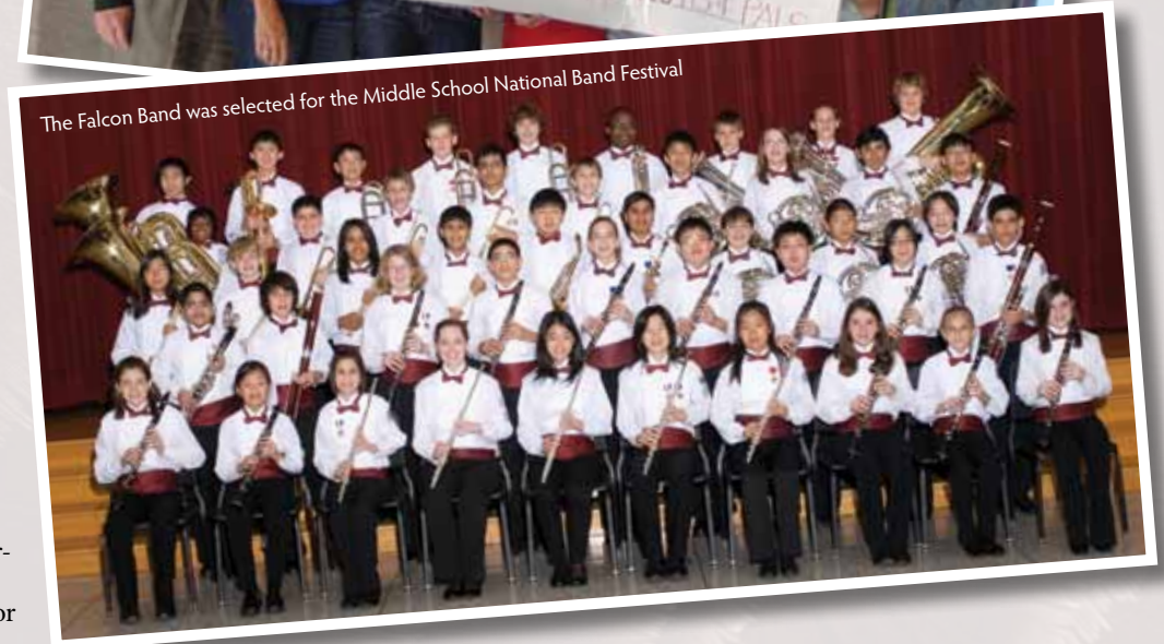
The Falcon Band was selected for the Middle School National Band Festival