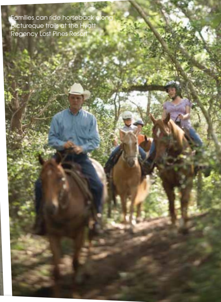
Families can ride horseback along picturesque trails at the Hyatt Regency Lost Pines Resort