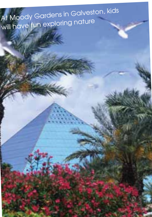
At Moody Gardens in Galveston, kids will have fun exploring nature