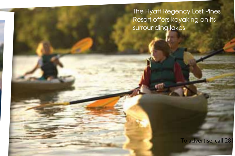
The Hyatt Regency Lost Pines Resort offers kayaking on its surrounding lakes