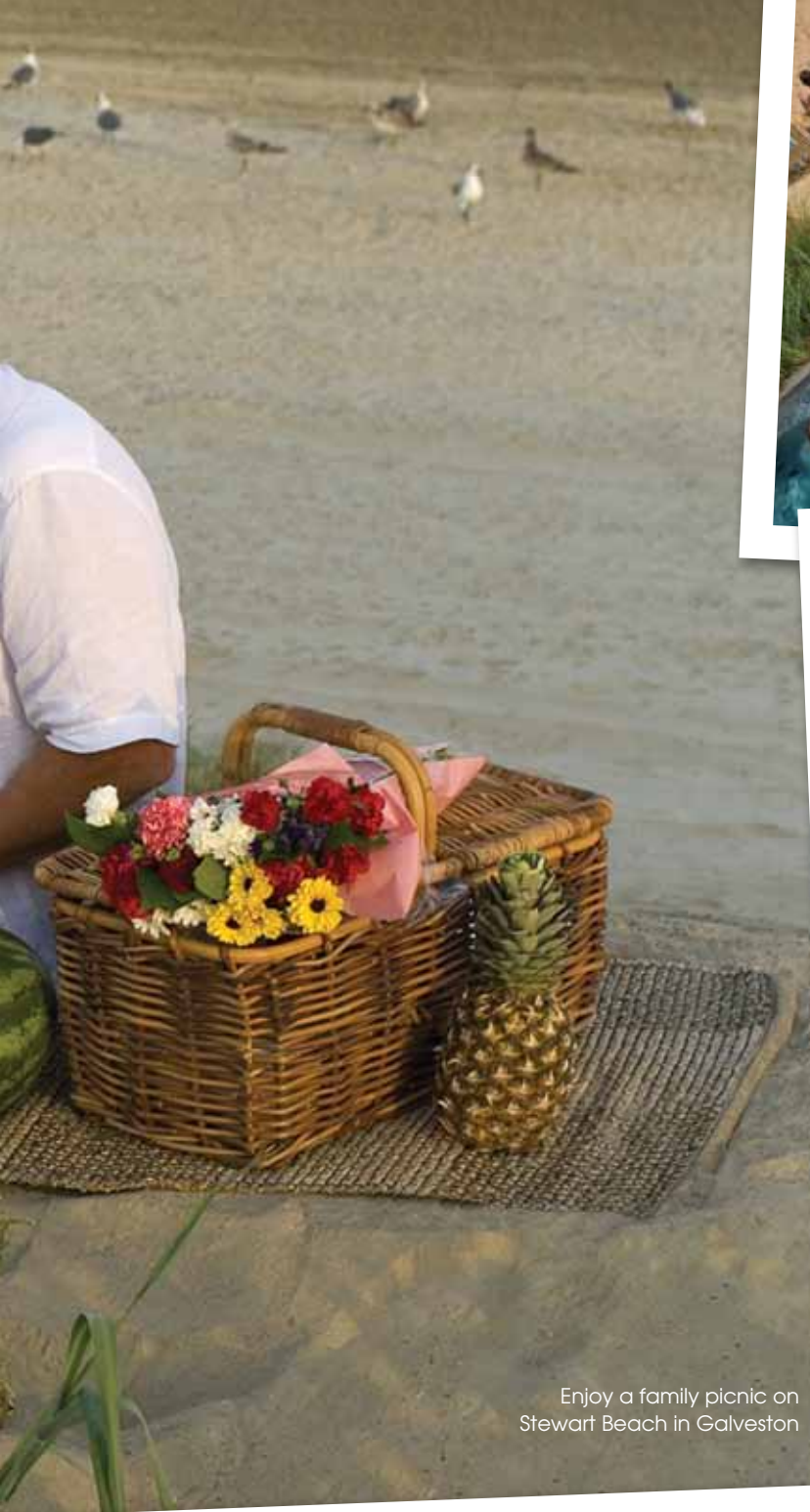
Enjoy a family picnic on Stewart Beach in Galveston