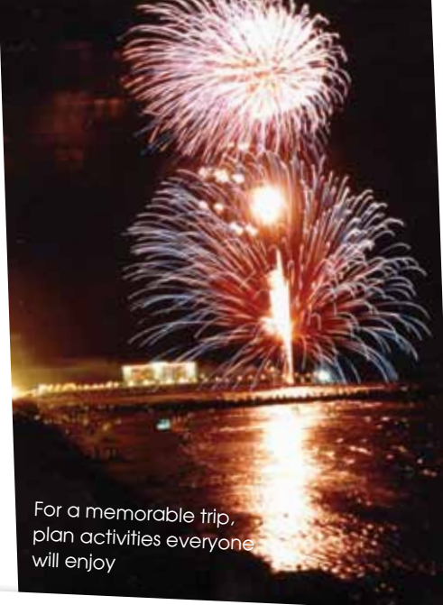
For a memorable trip, plan activities everyone will enjoy