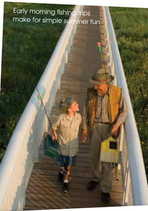
Early morning fishing trips make for simple summer fun