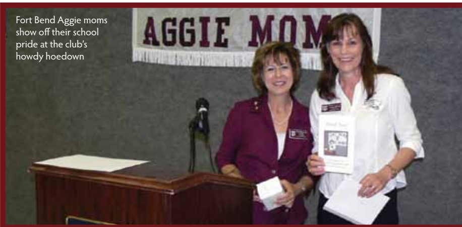
Fort Bend Aggie moms show off their school pride at the club's howdy hoedown