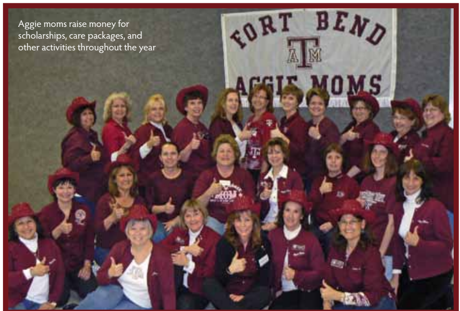
Aggie moms raise money for scholarships, care packages, and other activities throughout the year