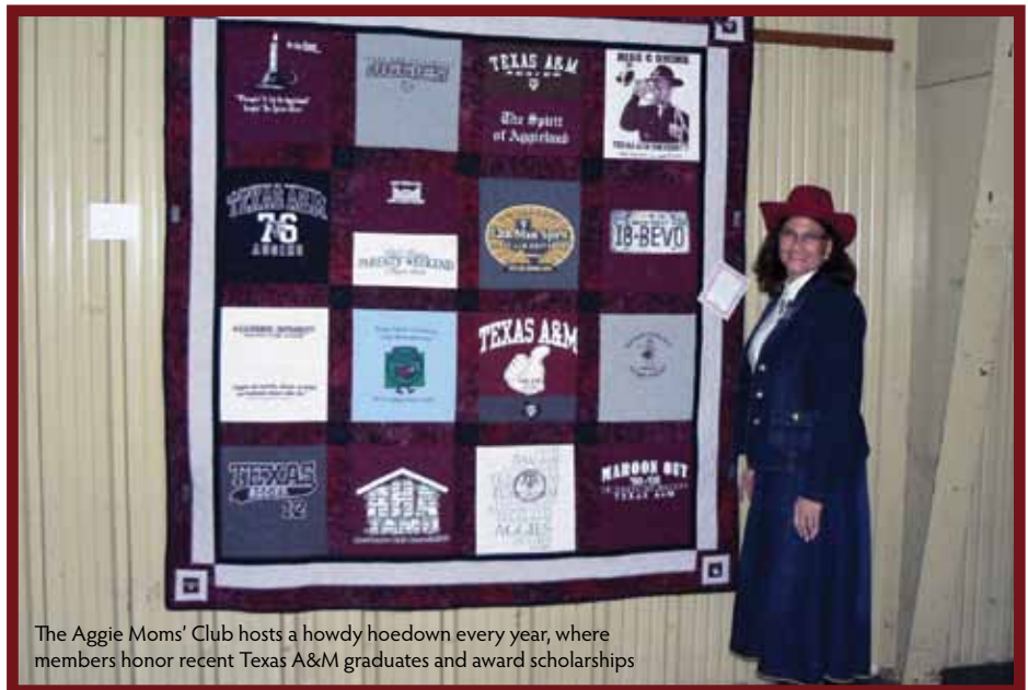
The Aggie Moms' Club hosts a howdy hoedown every year, where members honor recent Texas A&M graduates and award scholarships