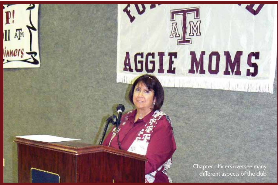
Chapter officers oversee many different aspects of the club