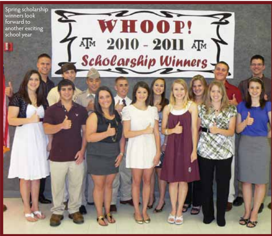
Spring scholarship winners look forward to another exciting school year