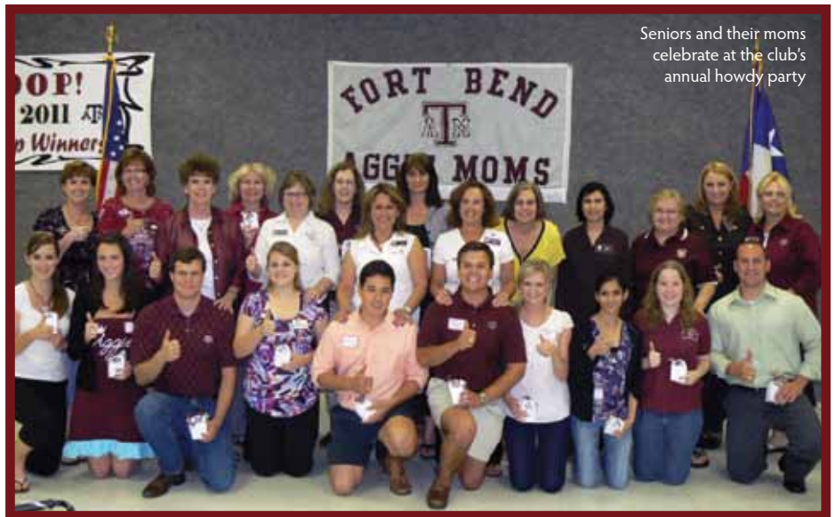
Seniors and their moms celebrate at the club's annual howdy party