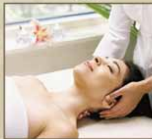
Trellis, a luxurious day spa