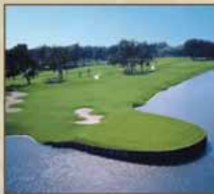
Championship golf course