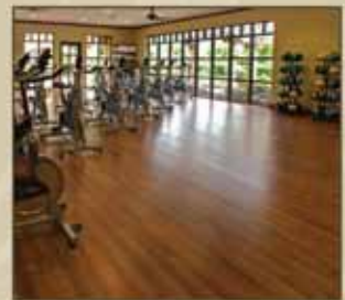
Fitness facilities and programs