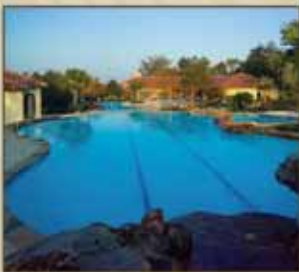
Two resort-style family pools