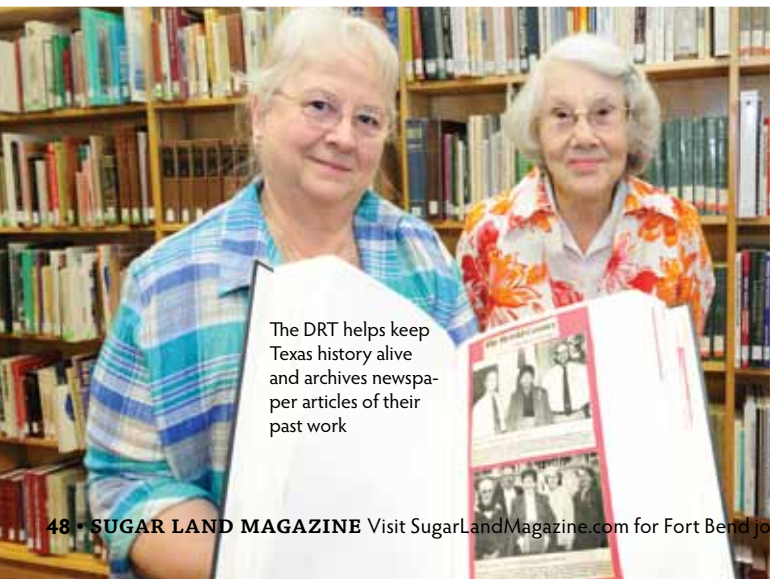
The DRT helps keep Texas history alive and archives newspaper articles of their past work