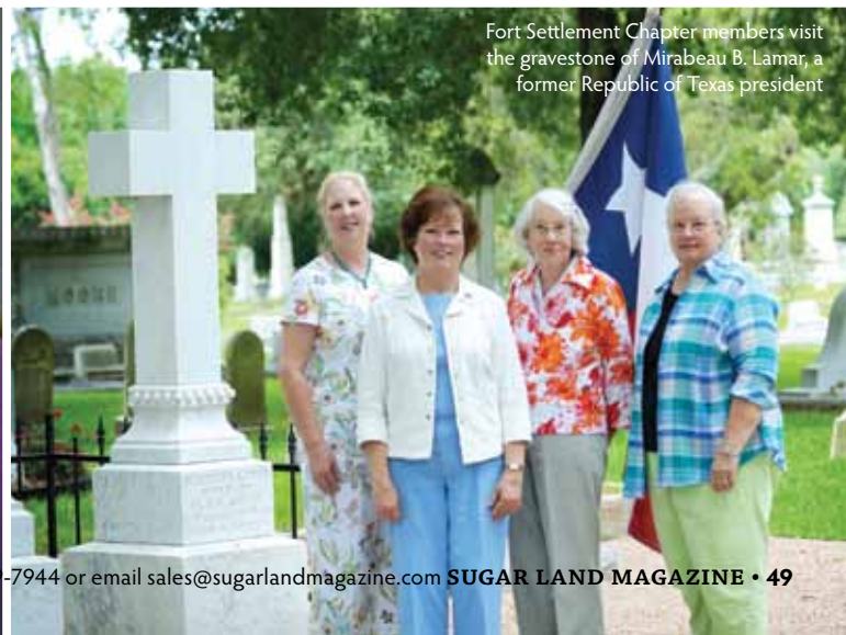
Fort Settlement Chapter members visit the gravestone of Mirabeau B. Lamar, a former Republic of Texas president