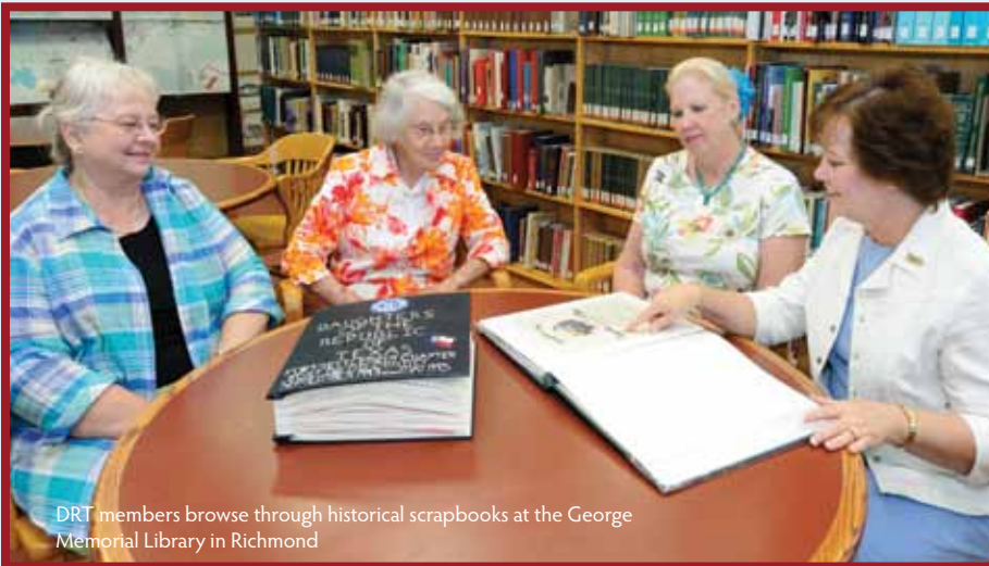
DRT members browse through historical scrapbooks at the George Memorial Library in Richmond