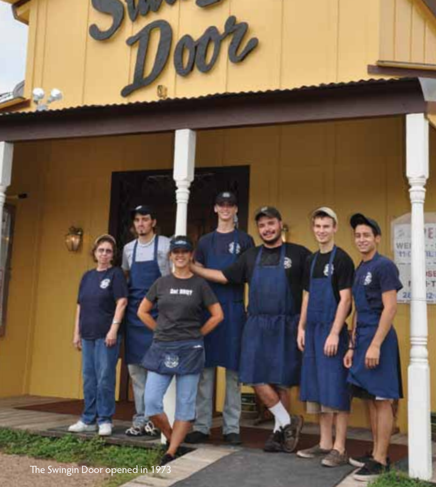
The Swinging Door opened in 1973