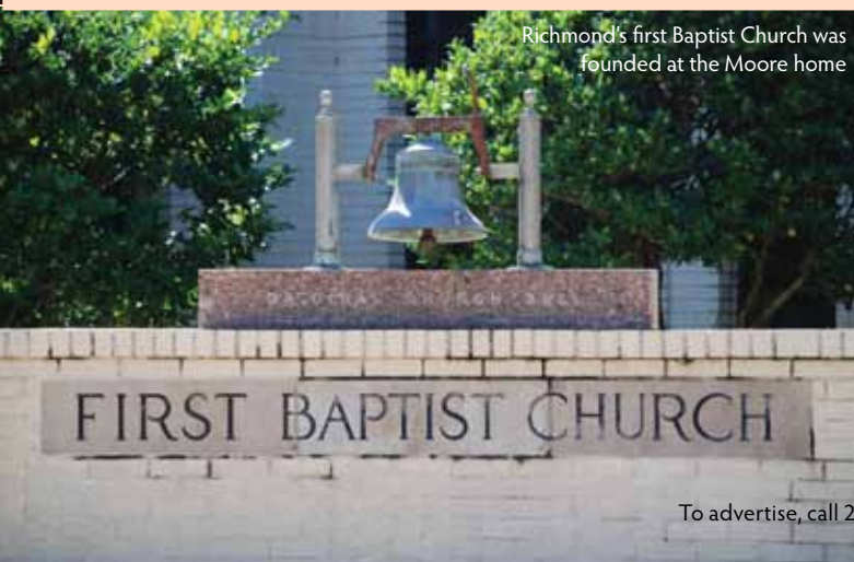
Richmond's first Baptist Church was founded at the Moore home