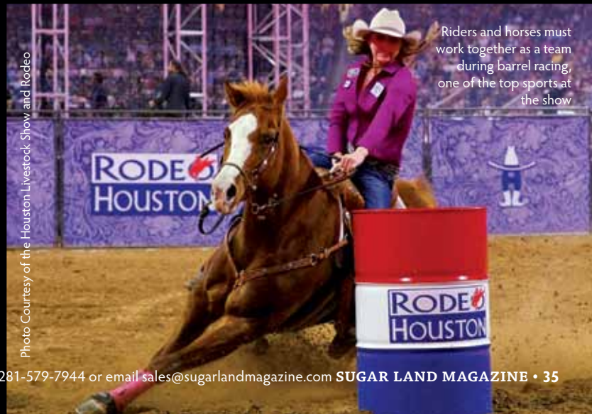
Riders and horses must work together as a team during barrel racing, one of the top sports at the show