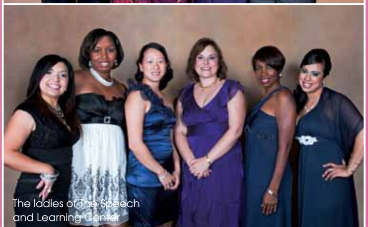
The Ladies of The Speech and Learning Center