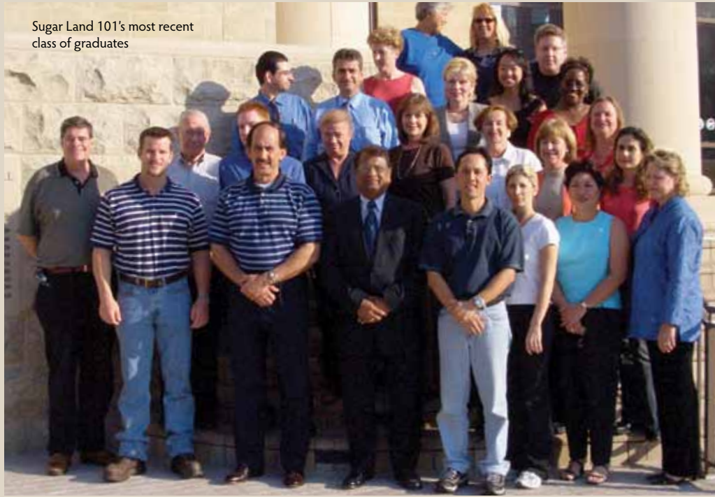
Sugar Land 101’s most recent class of graduates