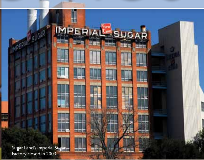
Sugar Land's Imperial Sugar Factory closed in 2003