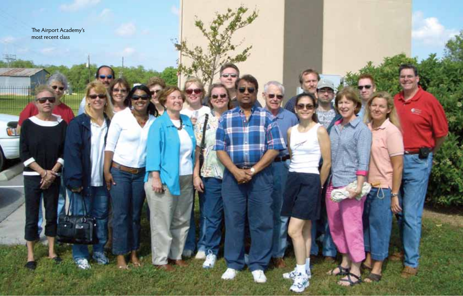
The Airport Academy's most recent class