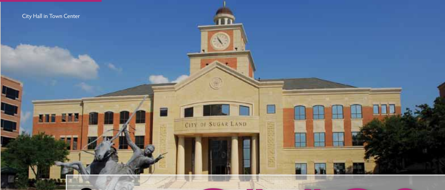
City Hall in Town Center