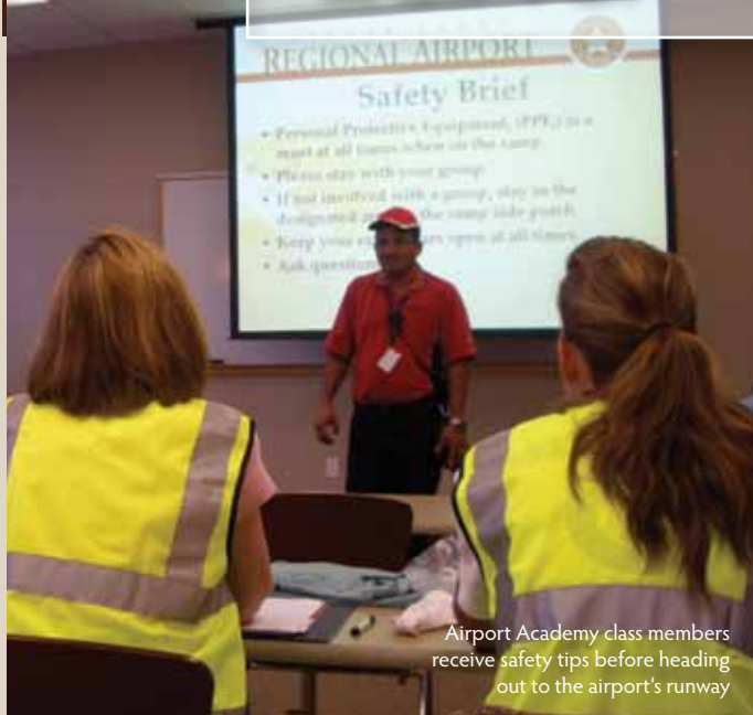
Airport Academy class members receive safety tips before heading out to the airport's runway