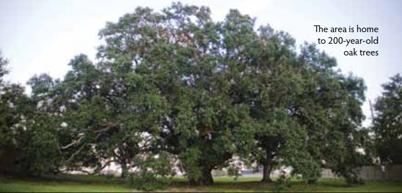
The area is home to 200-year-old oak trees