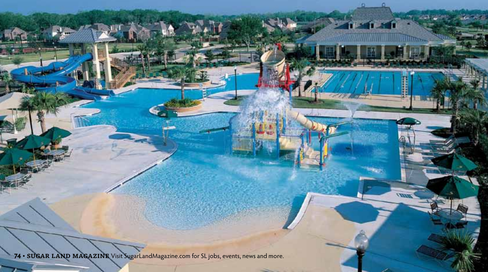
Cool off from the Texas heat at the Sienna Plantation club house