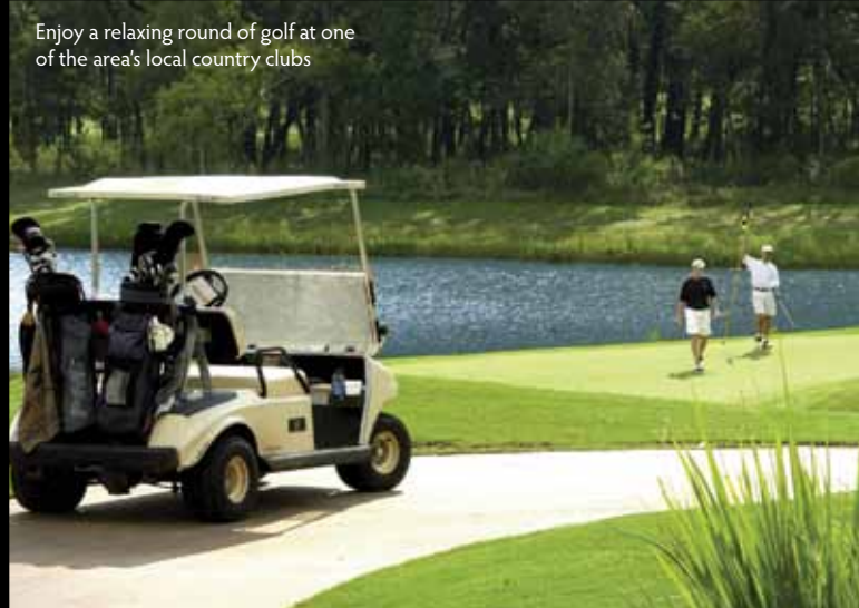
Enjoy a relaxing round of golf at one of the area's local country clubs