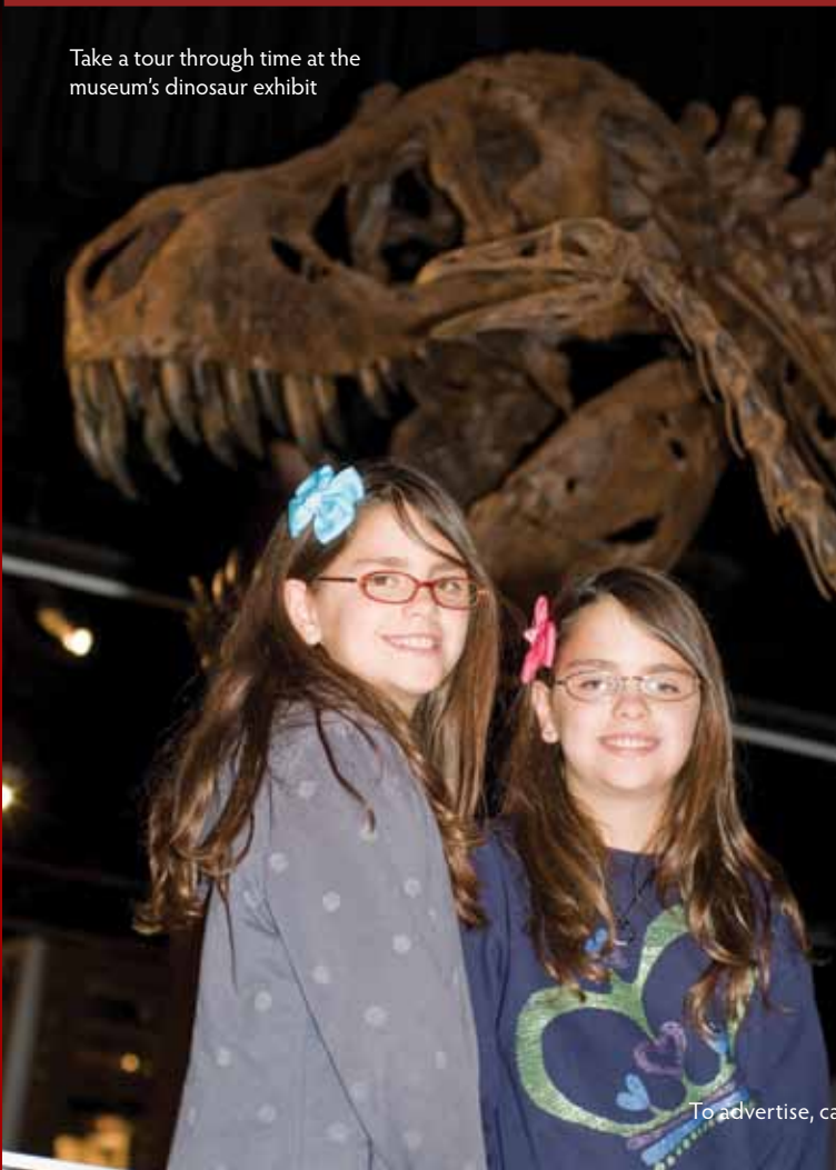
Take a tour through time at the museum's dinosaur exhibit