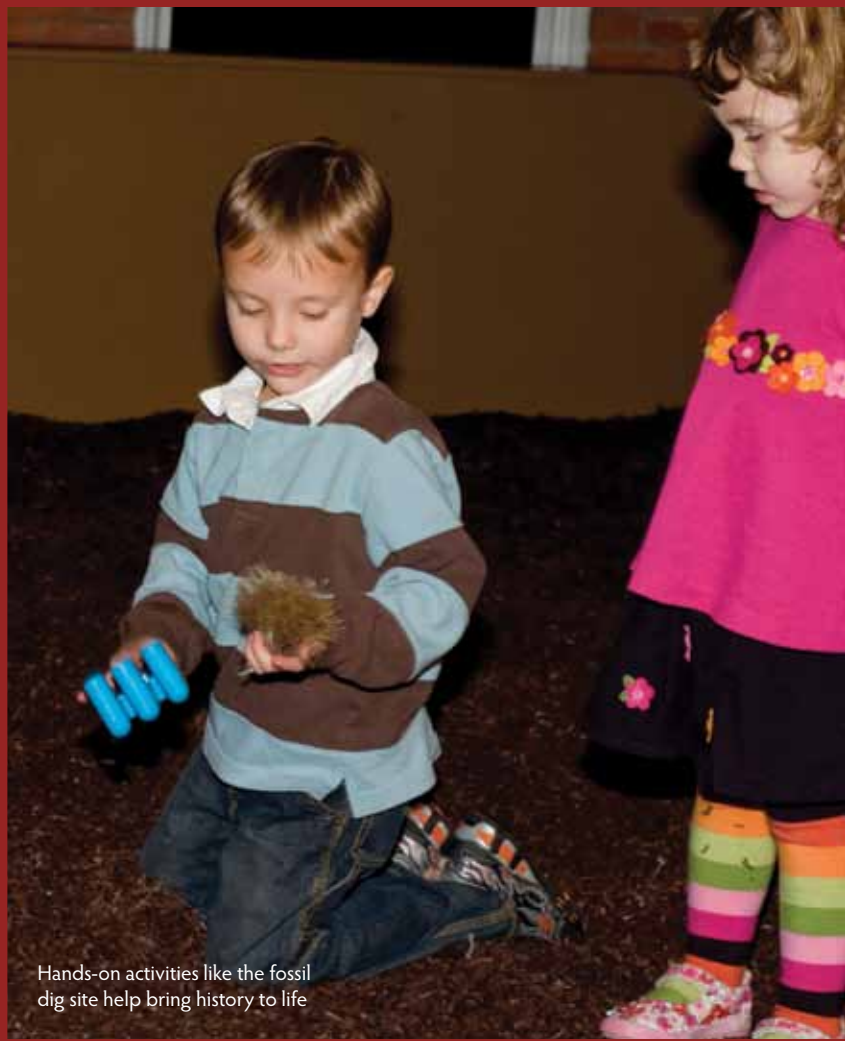
Hands-on activities like the fossil dig site help bring history to life