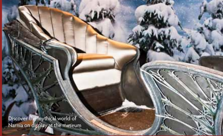
Discover the mythical world of Narnia on display at the museum