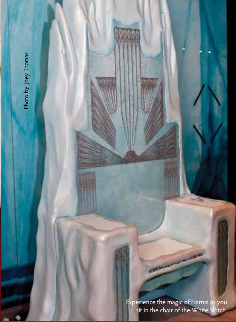
Experience the magic of Narnia as you sit in the chair of the White Witch.