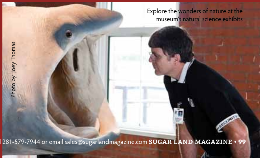
Explore the wonders of nature at the museum's natural science exhibits