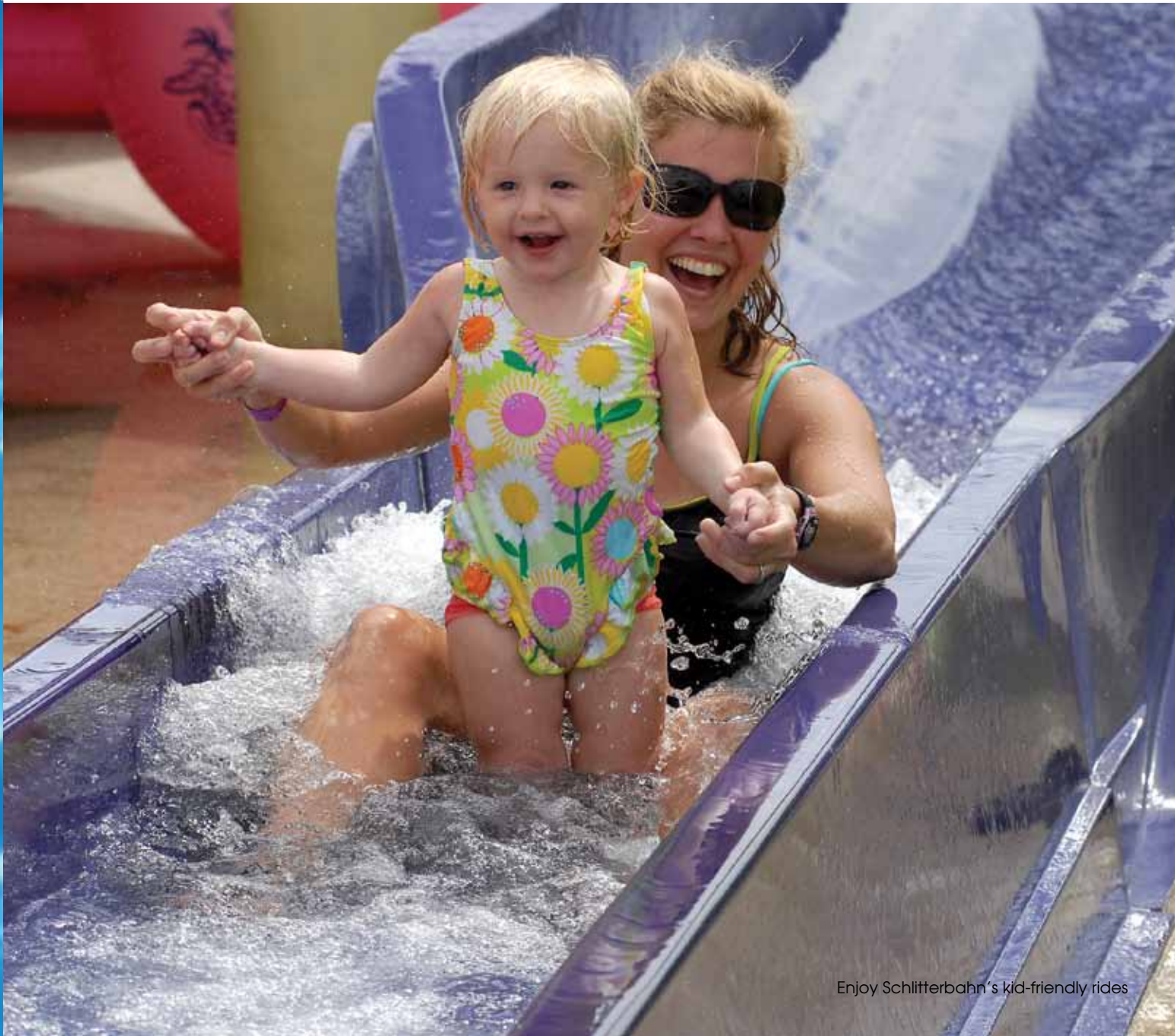
Enjoy Schlitterbahn's kid-friendly rides