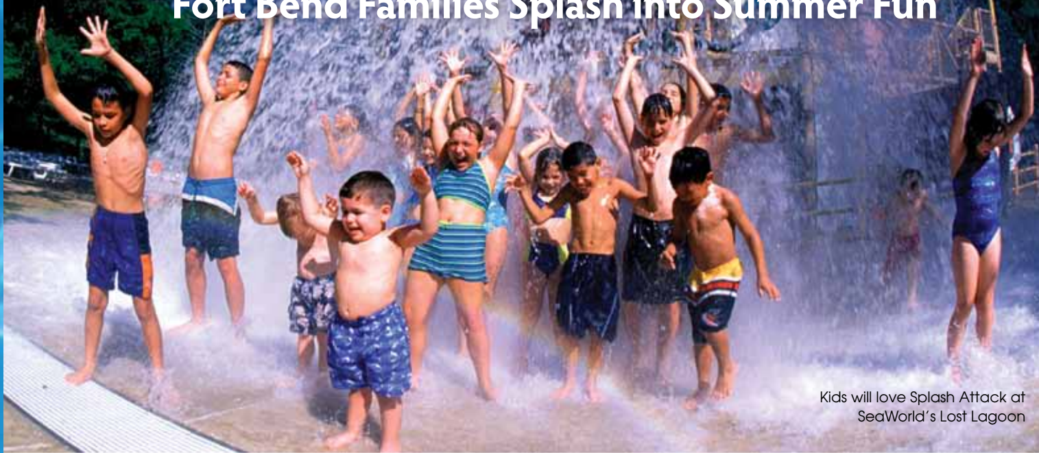
Kids will love Splash Attack at SeaWorld's Lost Lagoon

Fort Bend Families Splash into Summer Fun