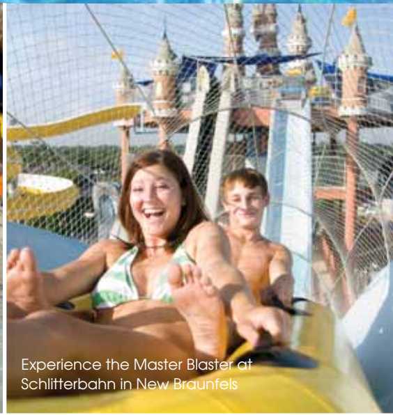
Experience the Master Blaster at Schlitterbahn in New Braunfels