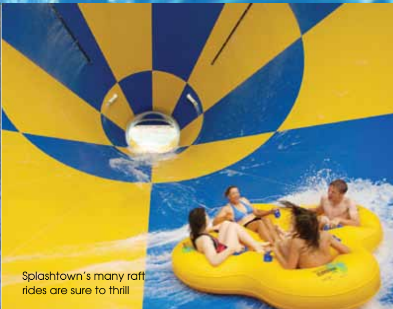
Splashtown's many raft rides are sure to thrill