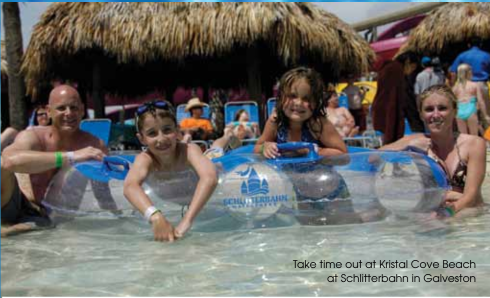
Take time out at Kristal Cove Beach at Schlitterbahn in Galveston