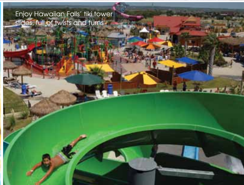
Enjoy Hawaiian Falls' tiki tower slides, full of twists and turns