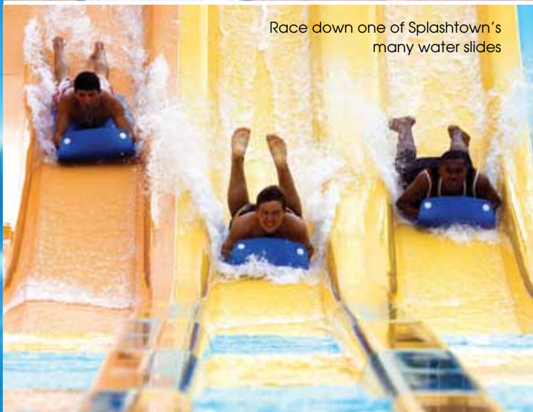
Race down one of Splashtown's many water slides