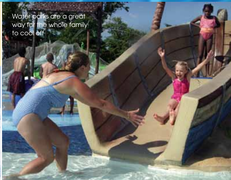
Water parks are a great way for the whole family to cool off

Looking for a way to cool off this summer while making a splash with the kids? In Texas, Fort Bend families can find a wide variety of water parks full of fun for all ages. Here is a snapshot of 10 terrific water parks in the Lone Star State perfect for summertime getaways that both you and your sweeties will love. So, grab your swimsuit, sunscreen, and sense of adventure, and make some memories!