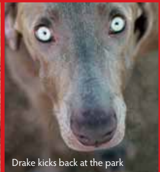
Drake kicks back at the park