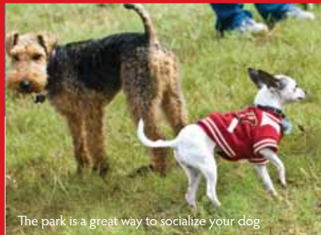
The park is a great way to socialize your dog