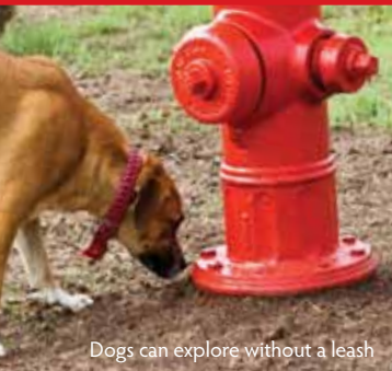
Dogs can explore without a leash