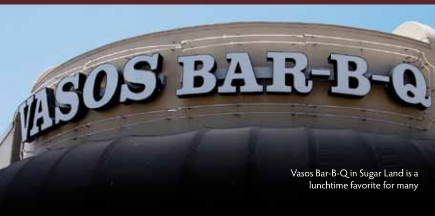
Vasos Bar-B-Q in Sugar Land is a lunchtime favorite for many