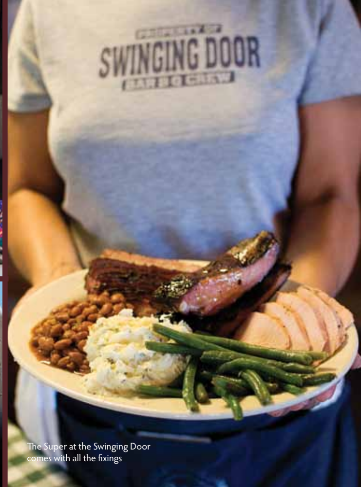
The Super at the Swinging Door comes with all the fixings