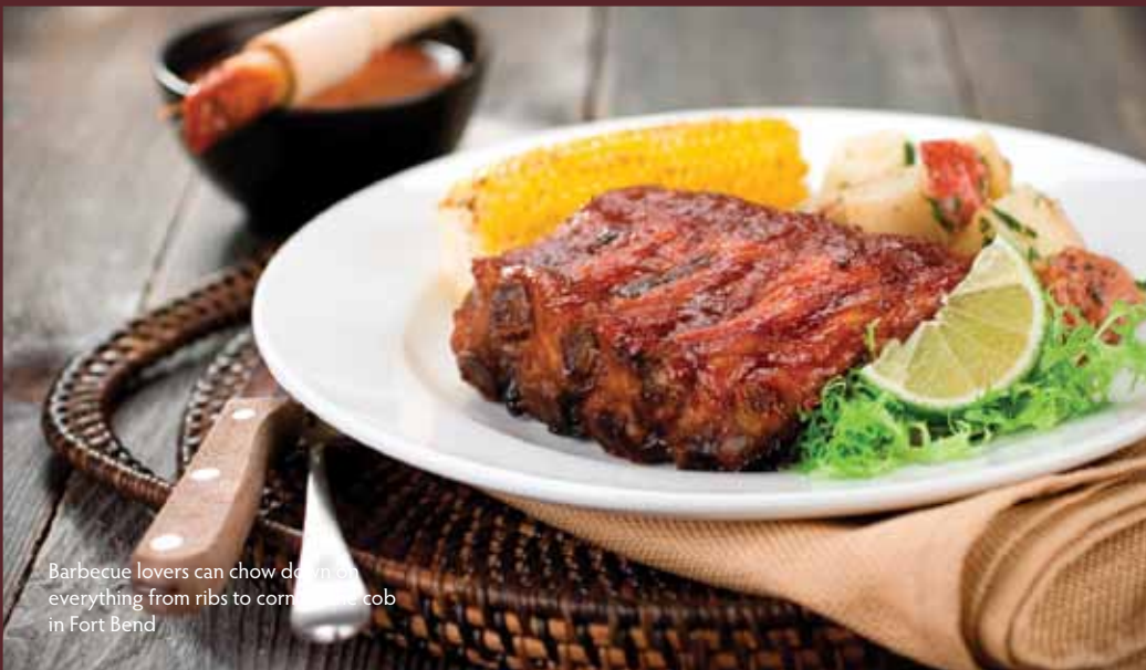
Barbecue lovers can chow down on everything from ribs to corn and cob in Fort Bend