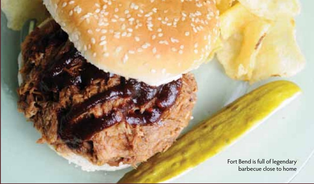
Fort Bend is full of legendary barbecue close to home