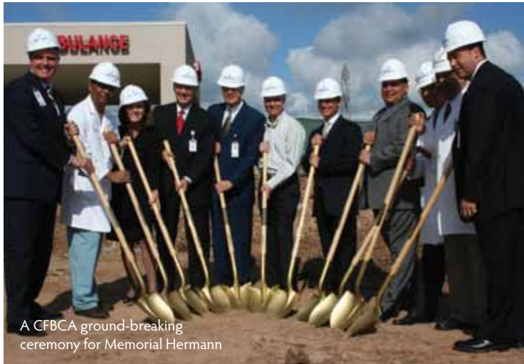
A CFBCA ground-breaking ceremony for Memorial Hermann