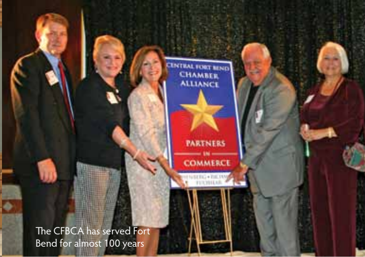
The CFBCA has served Fort Bend for almost 100 years