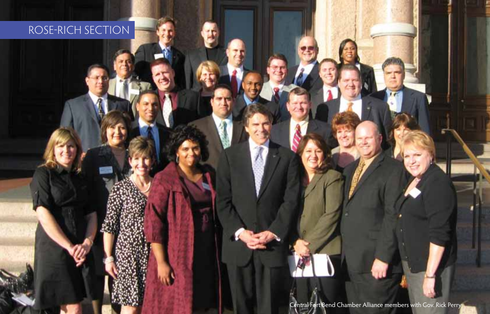
Central Fort Bend Chamber Alliance members with Gov. Rick Perry