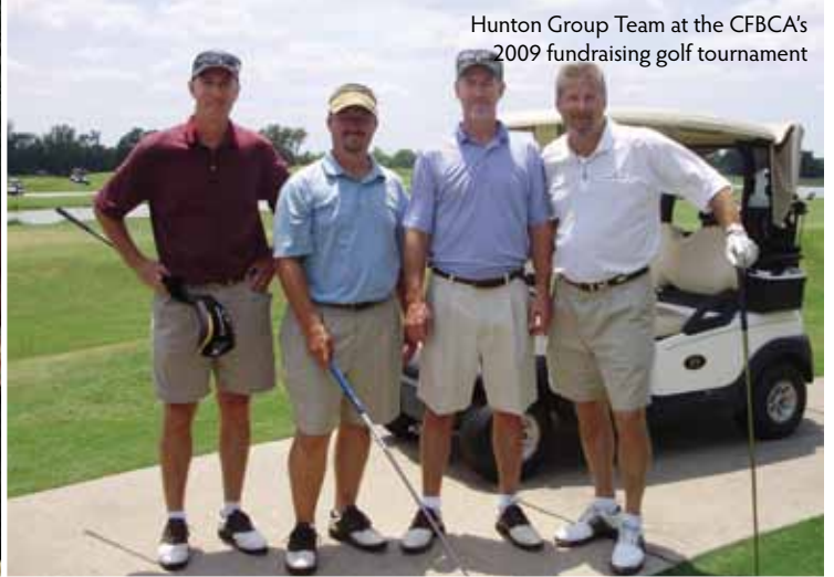
Hunton Group Team at the CFBCA's 2009 fundraising golf tournament