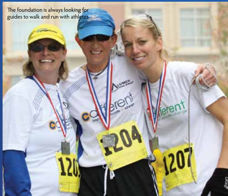
The foundation is always looking for guides to walk and run with athletes