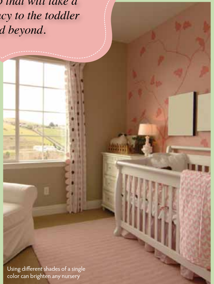
Using different shades of a single color can brighten any nursery