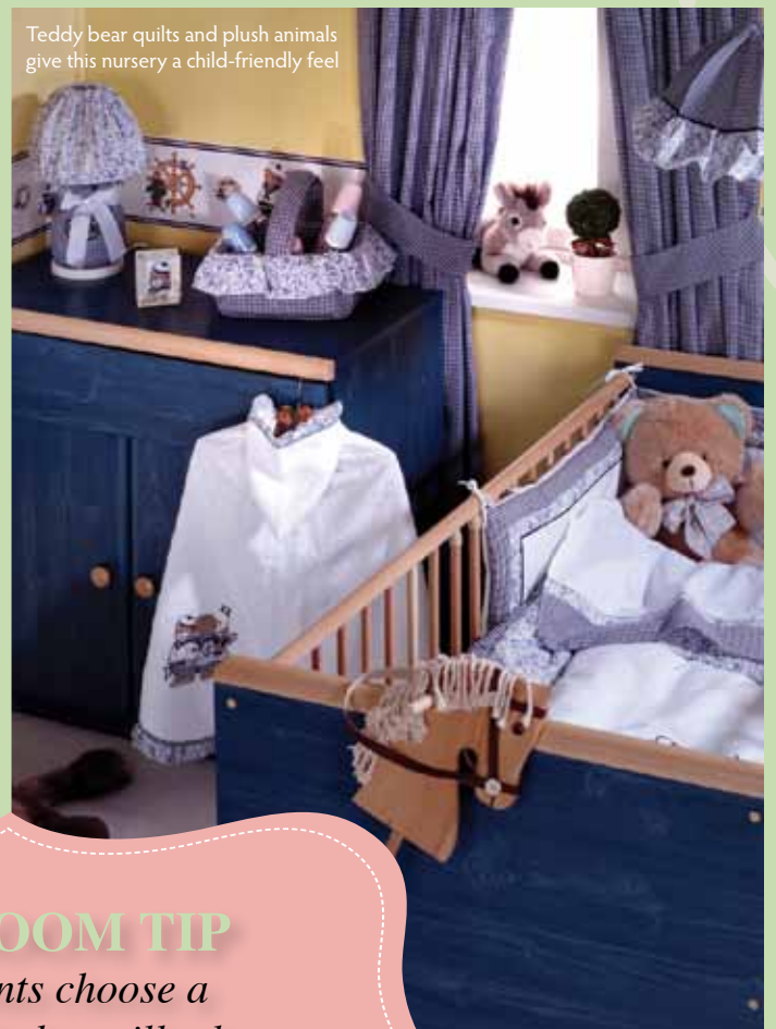
Teddy bear quilts and plush animals give this nursery a child-friendly feel

BABY ROOM TIP Many parents choose a convertible crib that will take a child from infancy to the toddler years and beyond.