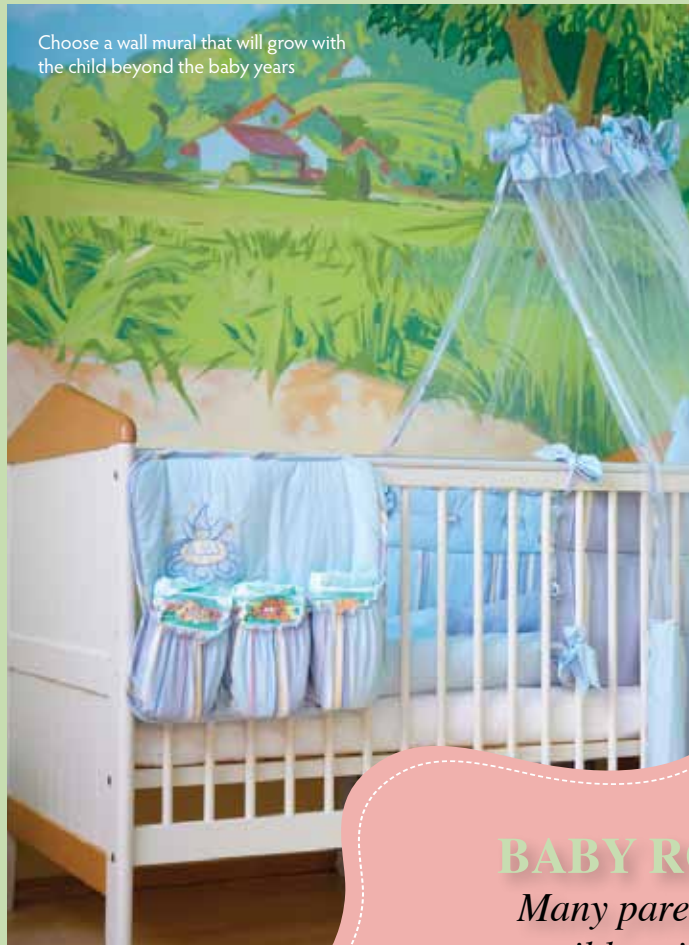
Choose a wall mural that will grow with the child beyond the baby years

Note: Toys are for decorative purposes only and should not be placed with baby inside the crib.