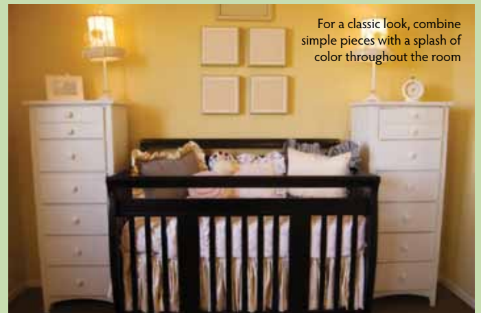
For a classic look, combine simple pieces with a splash of color throughout the room