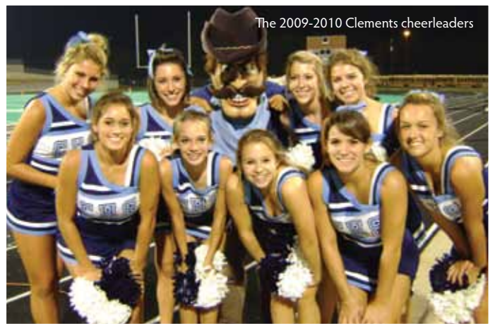
The 2009-2010 Clements cheerleaders