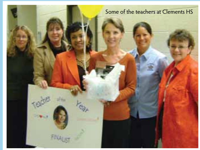
Some of the teachers at Clements HS

Although referred to as Clements High School, the name you see on the building is William P. Clements High School in honor of past Texas governor Bill Clements. The former governor made many contributions to the Texas education system. Clements now has about 2,800 students enrolled with over 750 incoming freshmen and they employ about 160 faculty members.